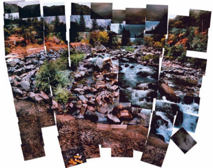
(David Hockney - Merced River, Yosemite Valley, Sept. 1982)

picture of reality. But at the same time photography simulates this reality. For example the cut out or colour sensor of a photo(camera) change the actual appearance of the subject in the image. Just as eye-vision, machine-vision represents the surrounding world by combining external stimuli and internal processes. It presents reality to us, but at all times as a processed representation of the actual.