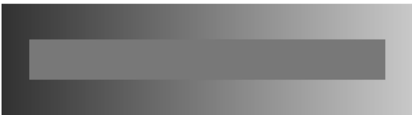
(Simultaneous contrast illusion)

In my works I try to create intangible appearances with light, these effects are the result of your visual system, which includes every part your body you use to see. But some of these perceptual effects are not categorized as a real appearance but as optical illusions, abstract images that seem to differ from objective reality. They are seen as an disruption of reality, a sort of temporary error. But if optical illusions are not real, why do we see them? Is there something wrong with our eyes? Is our way of seeing optical illusions the same as how we normally see the world? And is reality then also an illusion? Through empirical and theoretical research I try to answer these questions and research the relation between reality and illusion.